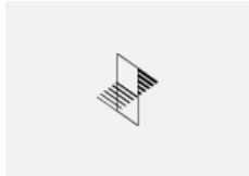
145-20700, W 2 pcs of wall fastening Lina45