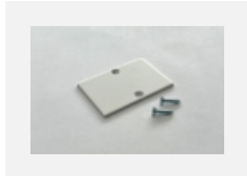
145-50101, W 2 x end cap - metal, screw