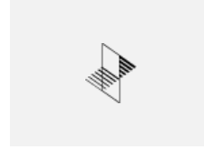
145-20700, B 2 pcs of wall fastening Lina45