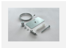
145-50305, N wire suspension for joint 6000mm - 1 pc + metal handle