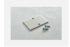
145-50101, B 2 x end cap - metal, screw