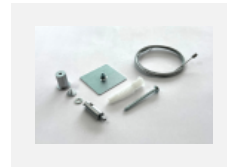
145-50302, N wire suspension 6000mm - 1 pc + metal handle