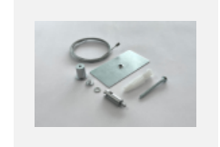
145-50305, N wire suspension for joint 6000mm - 1 pc + metal handle