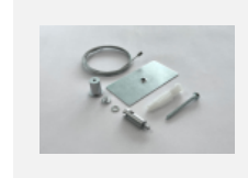
145-50304, N wire suspension for joint 4000mm - 1 pc + metal handle