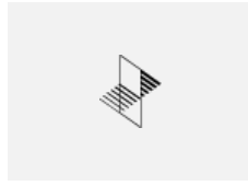
145-20700, W 2 pcs of wall fastening Lina45