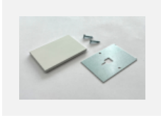
145-50102, S 2 x end cap - metal, screwless