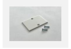
145-50101, S 2 x end cap - metal, screw