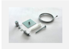
145-50302, N wire suspension 6000mm - 1 pc + metal handle