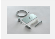
145-50303, N wire suspension for joint 2000mm - 1 pc + metal handle