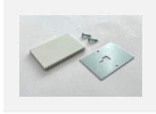
145-50102, S 2 x end cap - metal, screwless