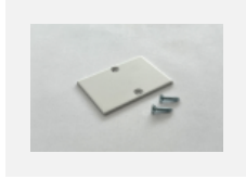
145-50101, S 2 x end cap - metal, screw