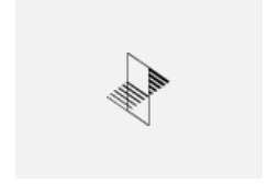
145-01200, F Accessory for gear-tray release for Lina145