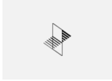
145-20700, S 2 pcs of wall fastening Lina45