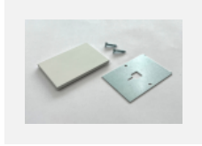
145-50102, S 2 x end cap - metal, screwless