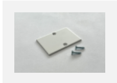
145-50101, W 2 x end cap - metal, screw