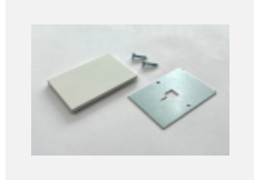
145-50102, W 2 x end cap - metal, screwless