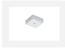
00-00370, W ceiling cup 80x80x32mm