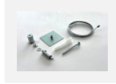
145-50300, N wire suspension 2000mm - 1 pc + metal handle