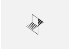
145-20700, B 2 pcs of wall fastening Lina45