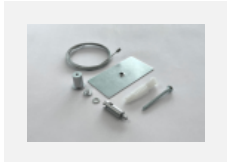
145-50304, N wire suspension for joint 4000mm - 1 pc + metal handle