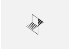
145-20700, W 2 pcs of wall fastening Lina45