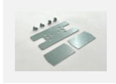
145-50200, F direct connector with caps of clearance