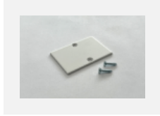
145-50101, W 2 x end cap - metal, screw