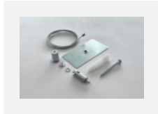
145-50304, N wire suspension for joint 4000mm - 1 pc + metal handle