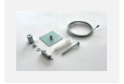
145-50301, N wire suspension 4000mm - 1 pc + metal handle