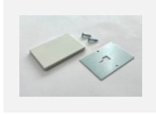
145-50102, W 2 x end cap - metal, screwless