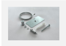
145-50303, N wire suspension for joint 2000mm - 1 pc + metal handle