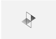
145-20700, S 2 pcs of wall fastening Lina45