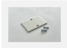
145-50101, S 2 x end cap - metal, screw