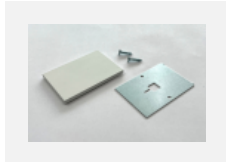
145-50102, S 2 x end cap - metal, screwless