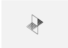
145-20700, B 2 pcs of wall fastening Lina45