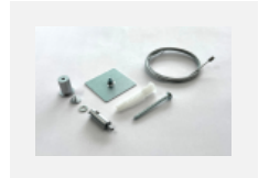
145-50301, N wire suspension 4000mm - 1 pc + metal handle