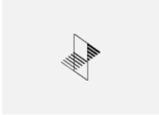
145-20700, W 2 pcs of wall fastening Lina45