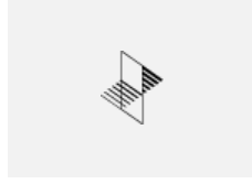
145-20700, B 2 pcs of wall fastening Lina45