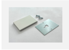
145-50102, S 2 x end cap - metal, screwless