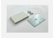
145-50102, S 2 x end cap - metal, screwless