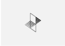
145-20700, S 2 pcs of wall fastening Lina45