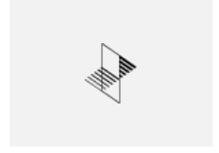
145-01200, F Accessory for gear-tray release for Lina145