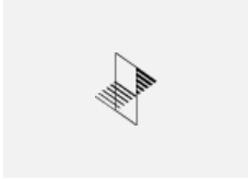
145-20700, B 2 pcs of wall fastening Lina45