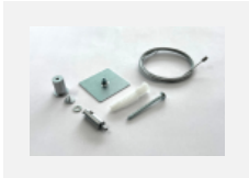
145-50302, N wire suspension 6000mm - 1 pc + metal handle