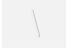
00-00357, W cable 5x0,75 6000mm, white