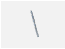
00-00354, K cable 5x0,75 1000mm