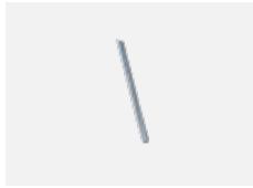
00-00352, K cable 3x0,75 2000mm