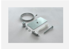
145-50305, N wire suspension for joint 6000mm - 1 pc + metal handle