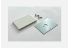
145-50102, B 2 x end cap - metal, screwless