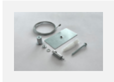
145-50304, N wire suspension for joint 4000mm - 1 pc + metal handle