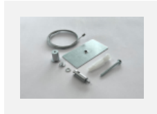
145-50305, N wire suspension for joint 6000mm - 1 pc + metal handle