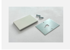
145-50102, W 2 x end cap - metal, screwless