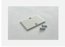
145-50101, W 2 x end cap - metal, screw