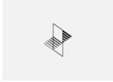
145-20700, W 2 pcs of wall fastening Lina45