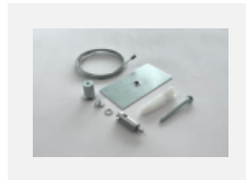
145-50305, N wire suspension for joint 6000mm - 1 pc + metal handle