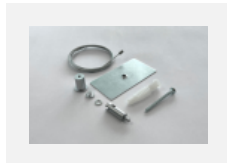
145-50305, N wire suspension for joint 6000mm - 1 pc + metal handle