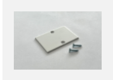
145-50101, B 2 x end cap - metal, screw