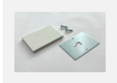
145-50102, B 2 x end cap - metal, screwless