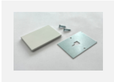
145-50102, B 2 x end cap - metal, screwless