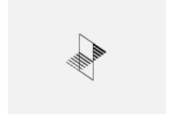
145-01200, F Accessory for gear-tray release for Lina145