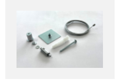
145-50301, N wire suspension 4000mm - 1 pc + metal handle