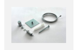
145-50301, N wire suspension 4000mm - 1 pc + metal handle