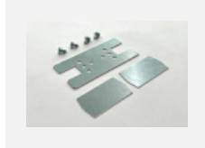
145-50200, F direct connector with caps of clearance