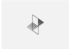
145-20700, W 2 pcs of wall fastening Lina45