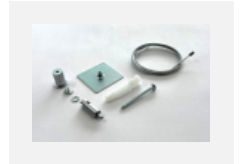
145-50301, N wire suspension 4000mm - 1 pc + metal handle