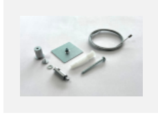
145-50300, N wire suspension 2000mm - 1 pc + metal handle