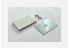
145-50102, W 2 x end cap - metal, screwless