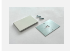
145-50102, W 2 x end cap - metal, screwless