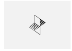
145-01200, F Accessory for gear-tray release for Lina145