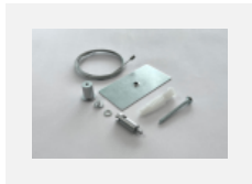
145-50304, N wire suspension for joint 4000mm - 1 pc + metal handle