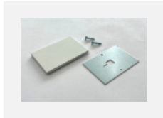
145-50102, W 2 x end cap - metal, screwless