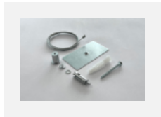
145-50305, N wire suspension for joint 6000mm - 1 pc + metal handle