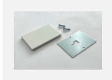
145-50102, B 2 x end cap - metal, screwless