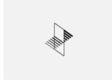
145-20700, W 2 pcs of wall fastening Lina45