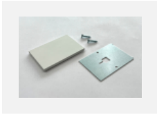
145-50102, W 2 x end cap - metal, screwless