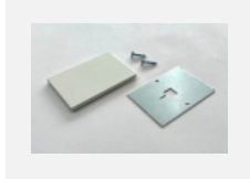
145-50102, W 2 x end cap - metal, screwless