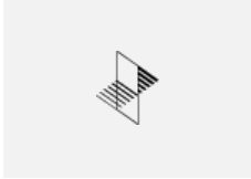
145-20700, W 2 pcs of wall fastening Lina45