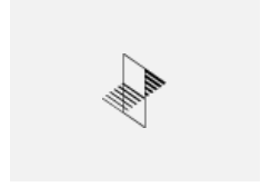
145-01200, F Accessory for gear-tray release for Lina145