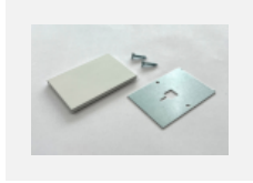
145-50102, B 2 x end cap - metal, screwless