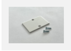
145-50101, B 2 x end cap - metal, screw