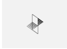
145-20700, B 2 pcs of wall fastening Lina45