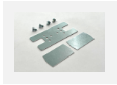
145-50200, F direct connector with caps of clearance