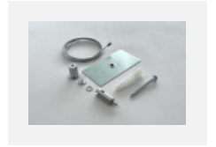
145-50303, N wire suspension for joint 2000mm - 1 pc + metal handle