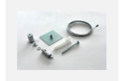
145-50301, N wire suspension 4000mm - 1 pc + metal handle