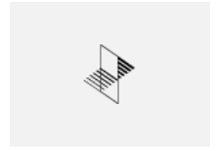
145-01200, F Accessory for gear-tray release for Lina145