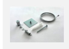
145-50300, N wire suspension 2000mm - 1 pc + metal handle