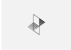
145-20700, S 2 pcs of wall fastening Lina45