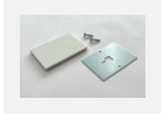
145-50102, S 2 x end cap - metal, screwless