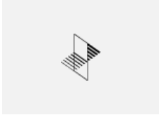
145-20700, S 2 pcs of wall fastening Lina45