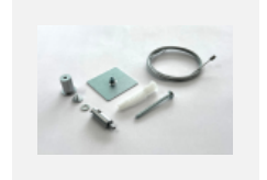
145-50302, N wire suspension 6000mm - 1 pc + metal handle