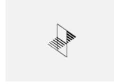
145-20700, S 2 pcs of wall fastening Lina45