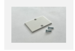
145-50101, S 2 x end cap - metal, screw