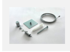
145-50302, N wire suspension 6000mm - 1 pc + metal handle