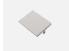
132-50100, W end cap