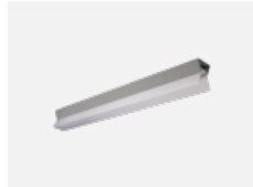
132-50031, W pendant profile 1000 mm