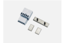
132-50200, F straight connector