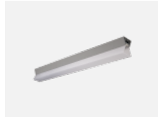
132-50031, S pendant profile 1000 mm