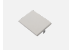
132-50100, S end cap